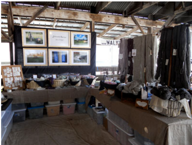
Johanneshof Romneys, above