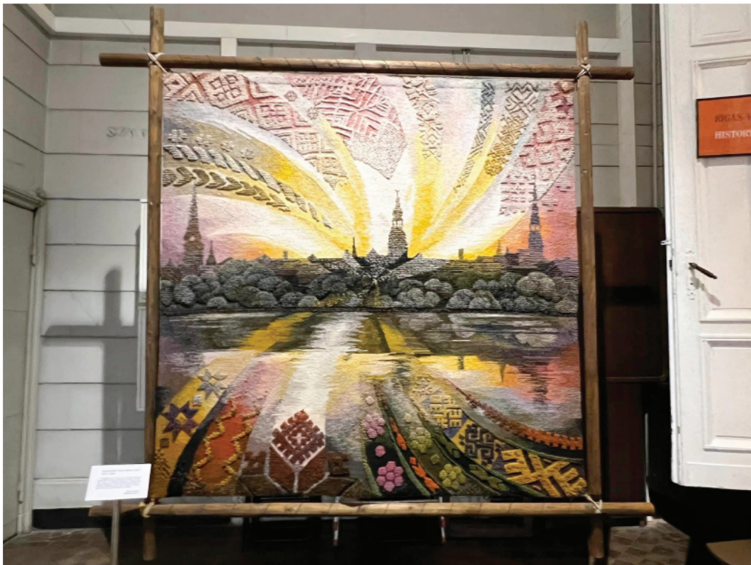
A cross stitch depiction of Riga, the capital of Latvia