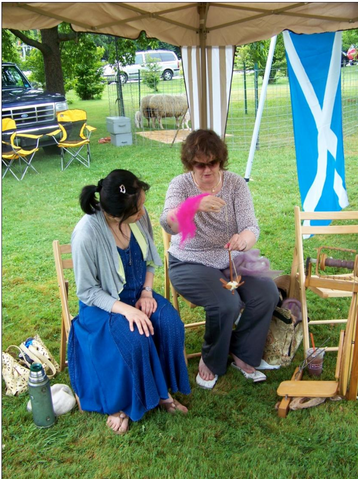
Because, you know: every Scottish tartan has to have some screaming pink in it.