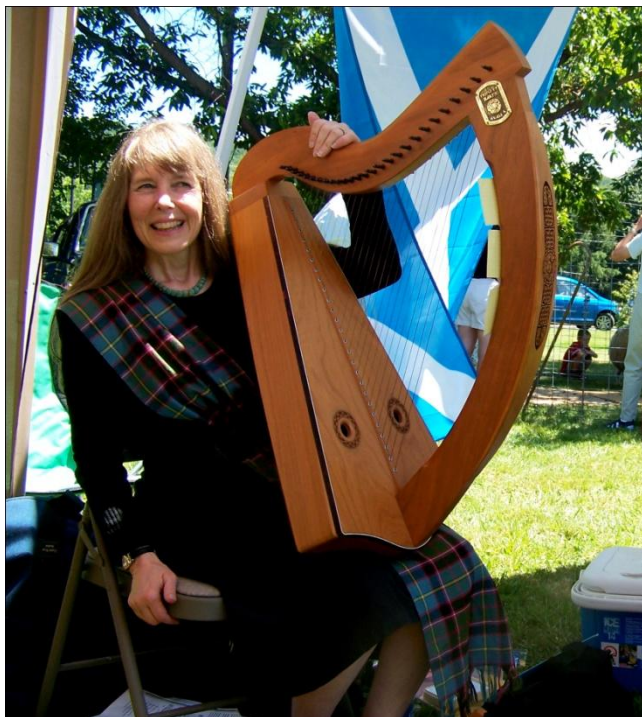
We had some terrific Scottish music in the tent!