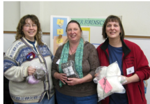
Three members from Genesee Valley Handspinners' Guild who won the Fiber Forensics contest.