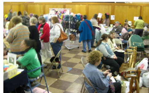
Looking out at everyone very busy knitting, talking, and shopping