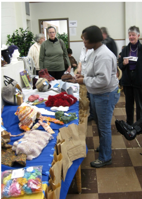
The Raffle which had lots of choices