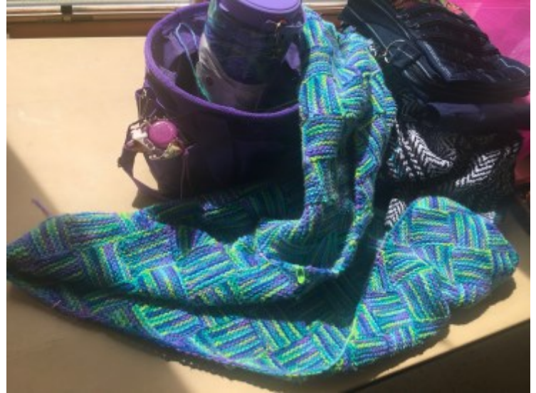
Entrelac knitting (For those who are as mesmerized by the pattern as I am, here is a link to a short tutorial )