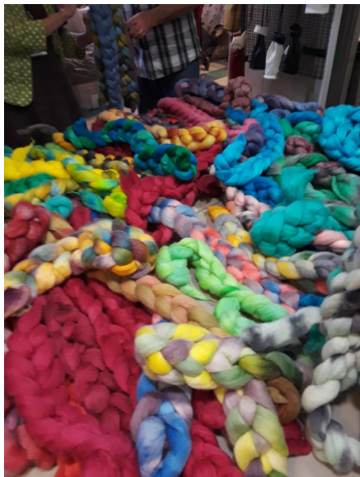
Large selection of braids for sale.