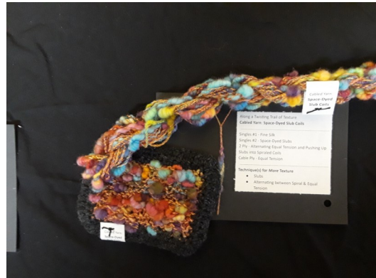
Variations on the Theme: Four different cabled yarns with knitted swatches from the same fiber base.