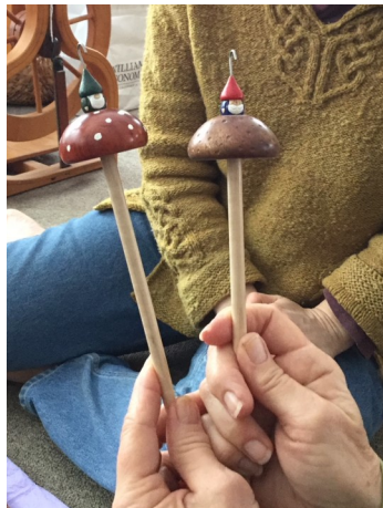
Gnomes on spindles