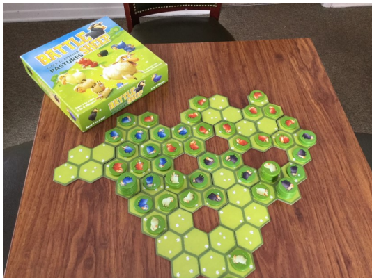
Battle Sheep battle field