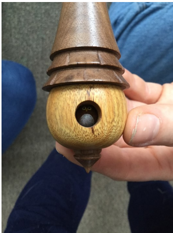
There is a little bird in the hole.