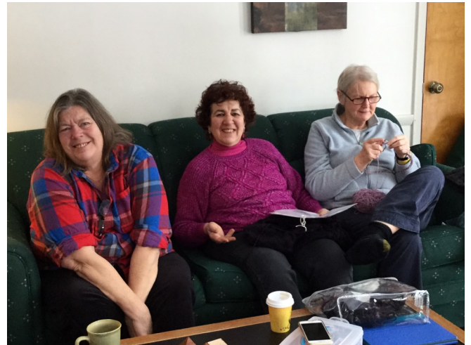
Knitters on the sofa