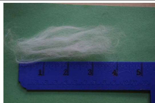
Angora lock with very little guard hair.

Angora guard hairs are a good deal finer and delicate than guard hair of larger fiber animals. In most cases the presence of guard hairs in the finished yarn/garment will not be noticeable. However, occasionally a rabbit has stronger guard hair, which might be experienced as uncomfortably prickly or