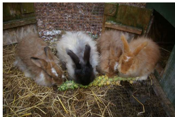
French and Satin Angoras enjoying brussel sprouts.

Angora rabbits are a popular pet choice for fiber enthusiasts, who want a fiber animal of their own, but don't have the acreage or energy required to keep larger animals. Angora rabbits, who range in size between just above 4 pounds to whooping 22 pounds, are small enough to be easily kept in a garden, on a porch, or even indoors in an apartment. Some people of course just want a fluffy pet and find themselves purchasing spindles and spinning wheels a few months after they have brought home their rabbit. Gardening spinners appreciate Angora rabbits not just for their fiber, but also for their enthusiasm for all the weeds pulled from the garden and the excellent fertilizer that can be applied directly without any need for composting.