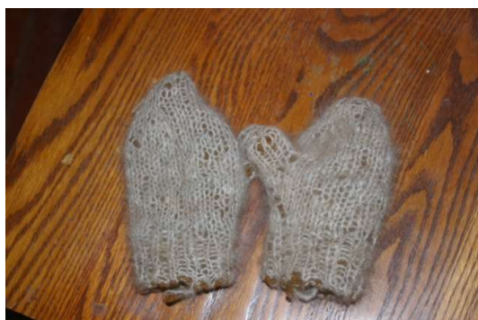
Angora three-ply yarn used as inner layer for mittens.

Angora is very delicate, very warm, and does not have 'memory'. Angora yarn is great for items that are warm, drapey and will not suffer much abrasion like scarves, shawls, or hats. Angora yarn lends itself particularly well to lace projects, which give the yarn room to bloom.