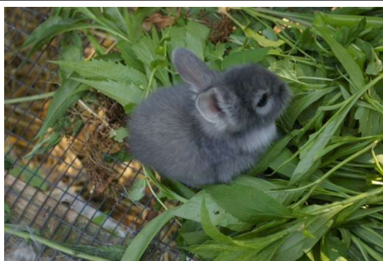
Young rabbit enjoying golden rod.